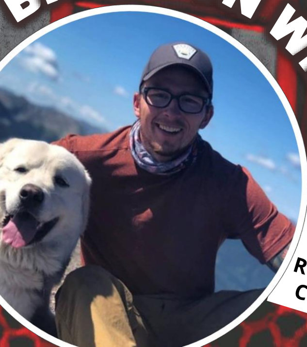
Director of Peer Support Line, Rocky Mountain Crisis Partners