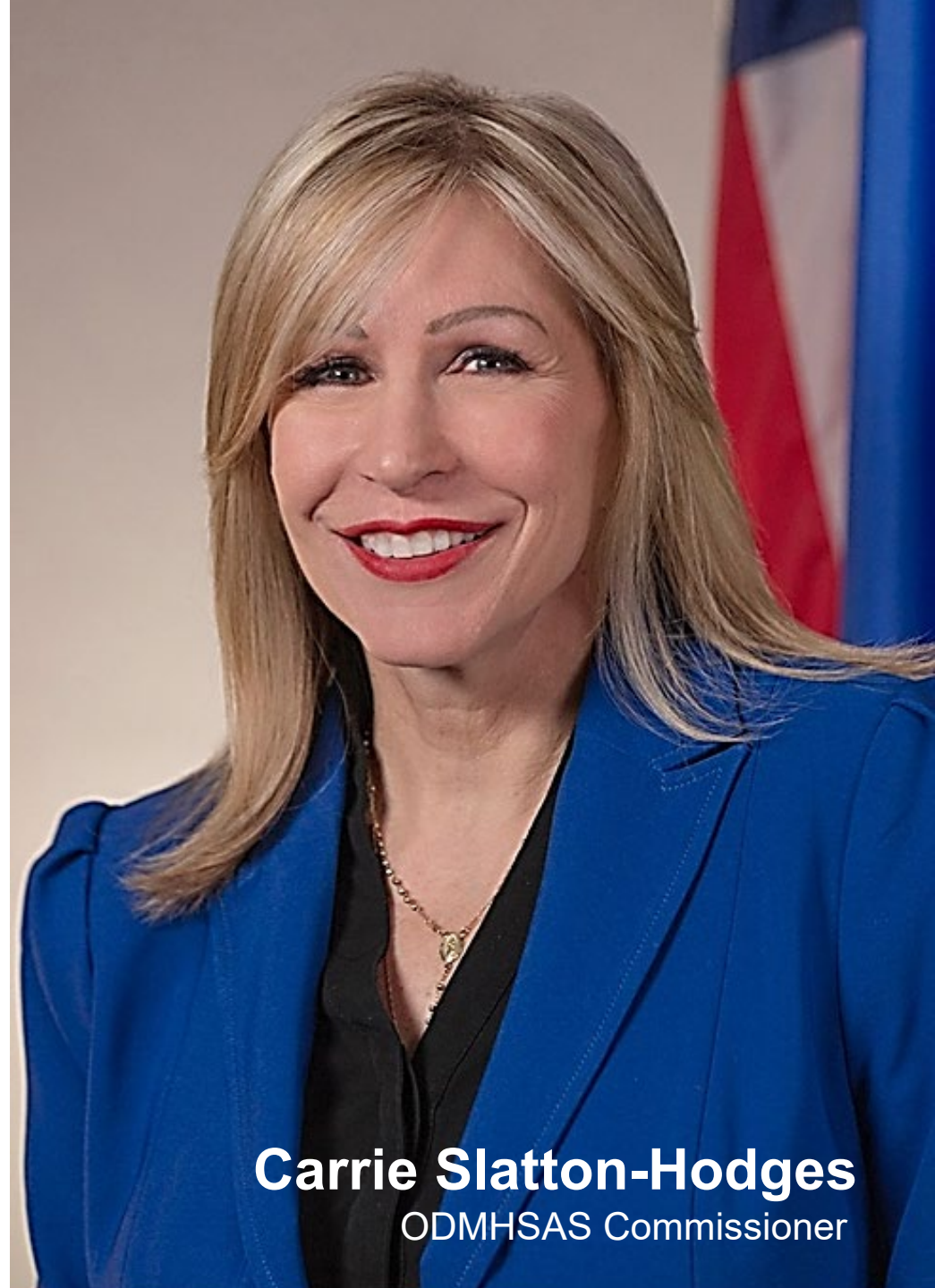
Carrie Slatton-Hodges ODMHSAS Commissioner